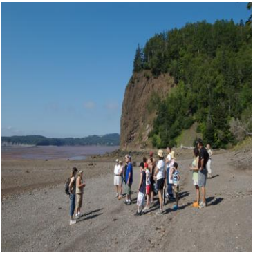
Our Class room is over 500 million years old.