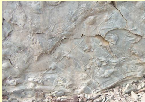
Amphibian Trackways at Rams Head

The rocks of Ram's Head-West Bay area present a cross section through Parrsboro's geologic past. They tell of the warm tropical coal swamps, rivers and shallow lakes that existed during the formation of Pangea before the beginning of the age of dinosaurs. This area has some of the most spectacular exposures of amphibian trackways to be found in the Parrsboro area.